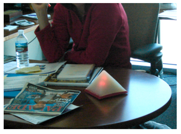
Figure 1: Nimio in its natural habitat.

Motivated by these questions, we have been experimenting with simple devices that can be used to maintain informal contact and interaction for distributed groups. Nimio is a system comprising a series of physical objects designed as individual playthings, but wirelessly networked to act as both input and output devices for a collective visualization of distributed activity (see Fig. 1). These hand-held, translucent silicone toys have embedded sensors (for input) and LEDs (for output) that allow them to be reactive to both sound and touch. Action around one Nimio will cause the others to glow in different patterns and colors. The interaction design is deliberately open-ended, in order to allow the emergence of distinctive patterns of collaborative engagement in real groups. This tension between legibility and ambiguity is a central aspect of our design.